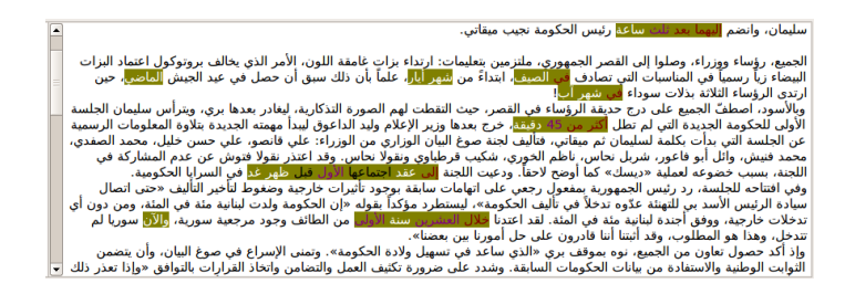
Fig. 3. Screenshot from ATEEMA.

FST increments iw_m if it was in the Maybe Time and a non-temporal word was detected, and resets it when entering the Maybe Time state or when a temporal word is detected. The counter iw_t denotes the number of non-temporal words met within the Time state and is updated in a similar fashion to iw_m .